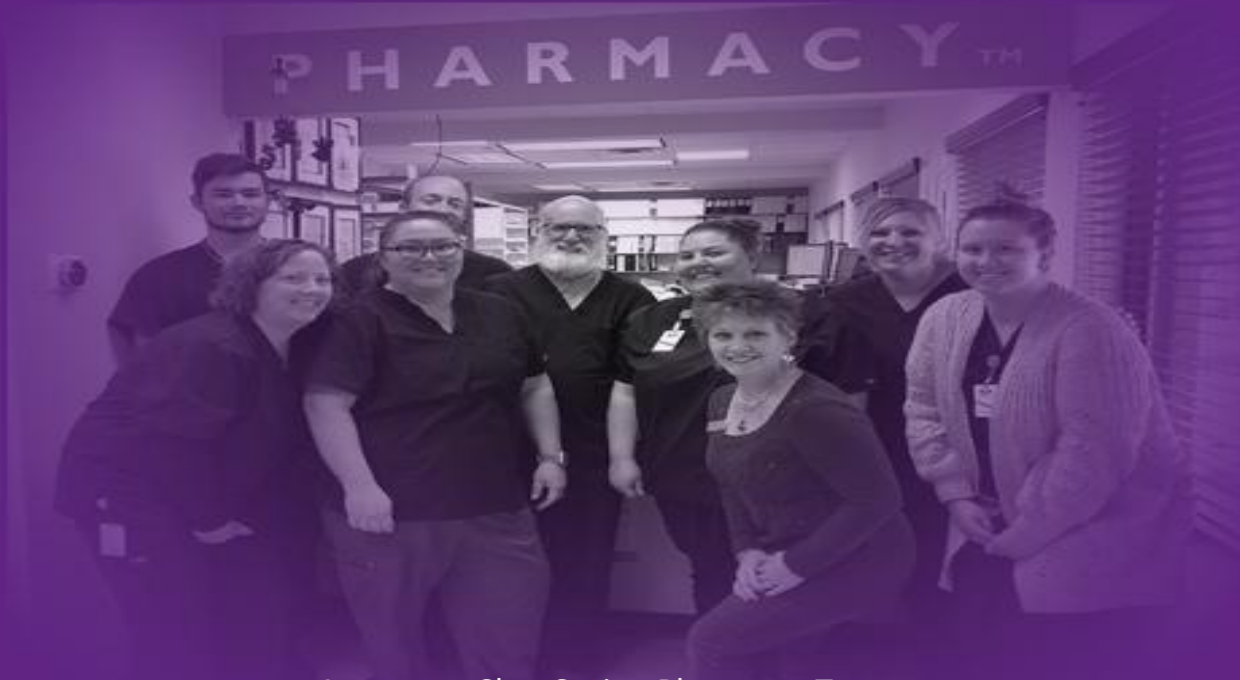
Awesome ClearSpring Pharmacy Team