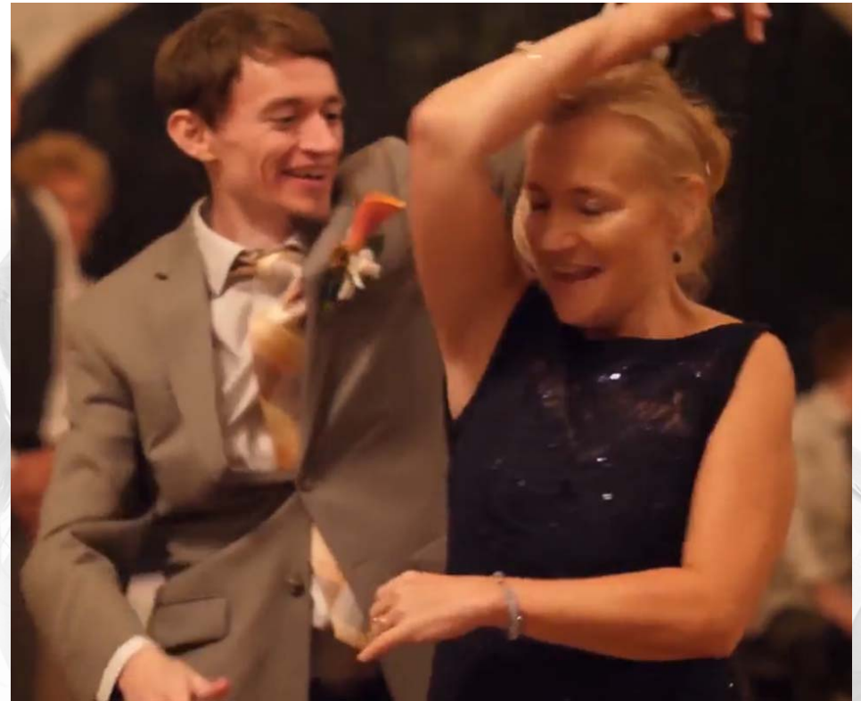
Mother-Son Dance at Son's Wedding, 10/20/18